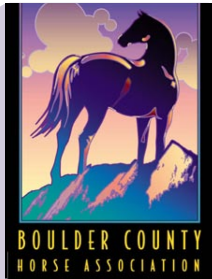
11TH EDITION Horse Services Directory

NEW print & online edition! coming October 2010