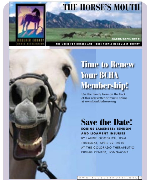
Horse's Mouth Newsletter

NEW print & online edition! coming October 2010