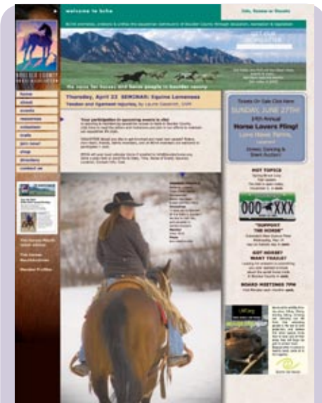
BCHA website www.boulderhorse.org